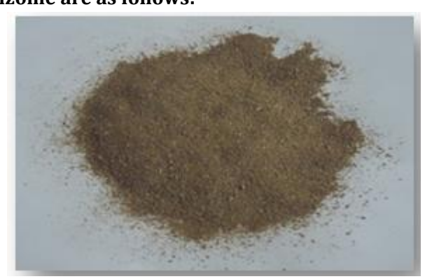
Figure 2. Powder of P. kurroa rhizome