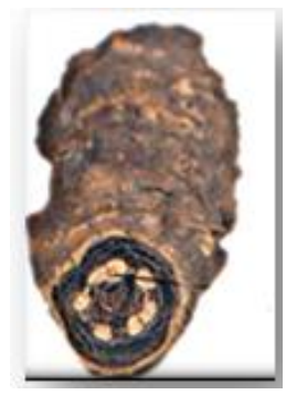
Figure 1. Rhizome of P. kurroa