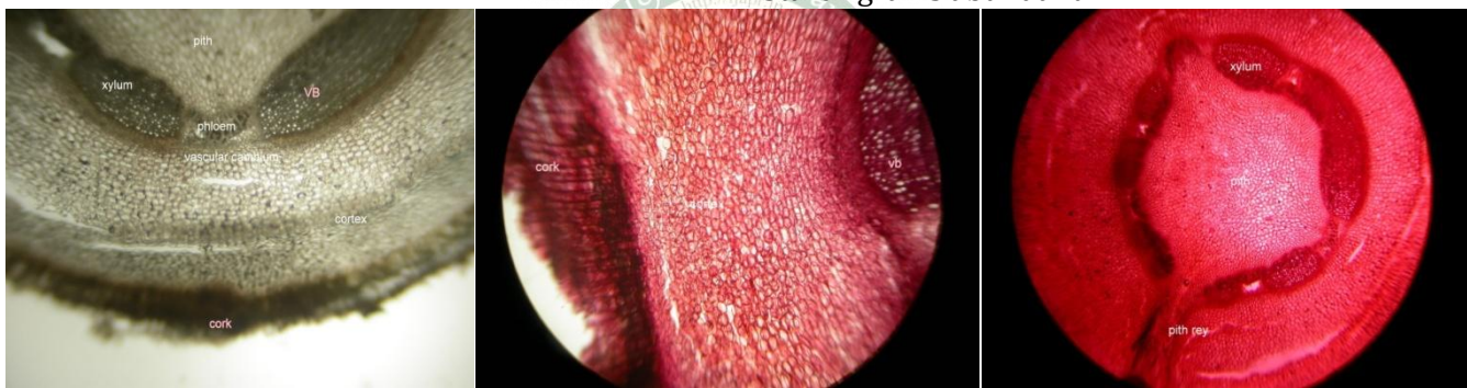
Figure 3. T.S. of rhizome of Picrorhiza kurroa Royle ex Benth.