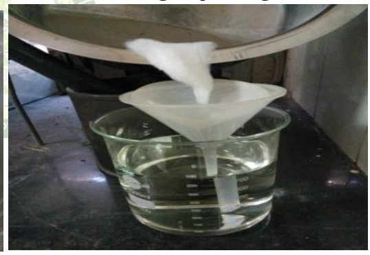
Fig:3 Preparation of Ksharajala and filtration