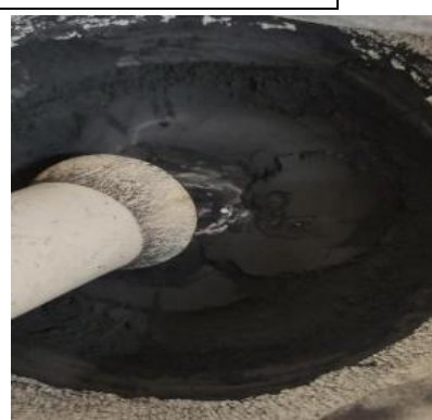
Fig No 1. Kajjali Preparation