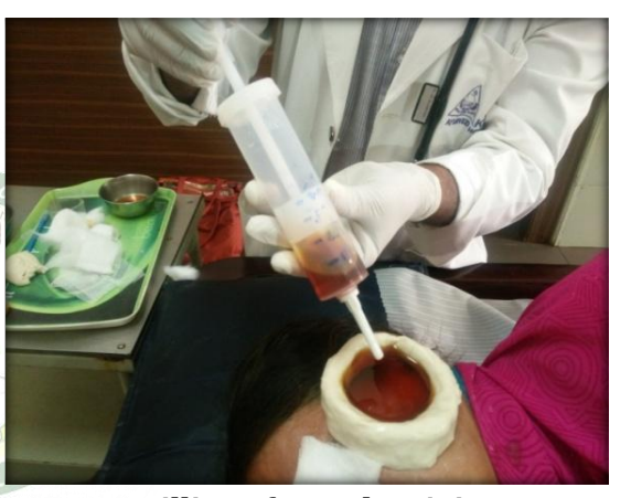
Filling of Hanubasti ring