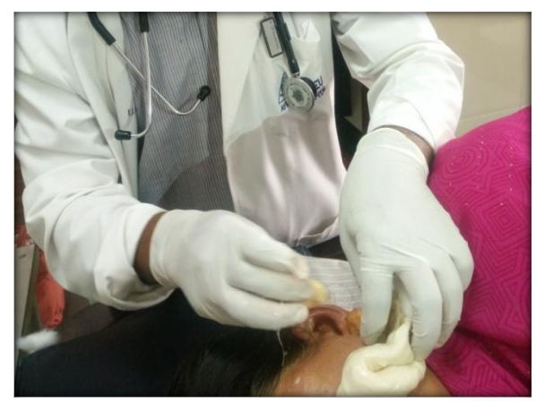
Removing of the Hanubasti ring