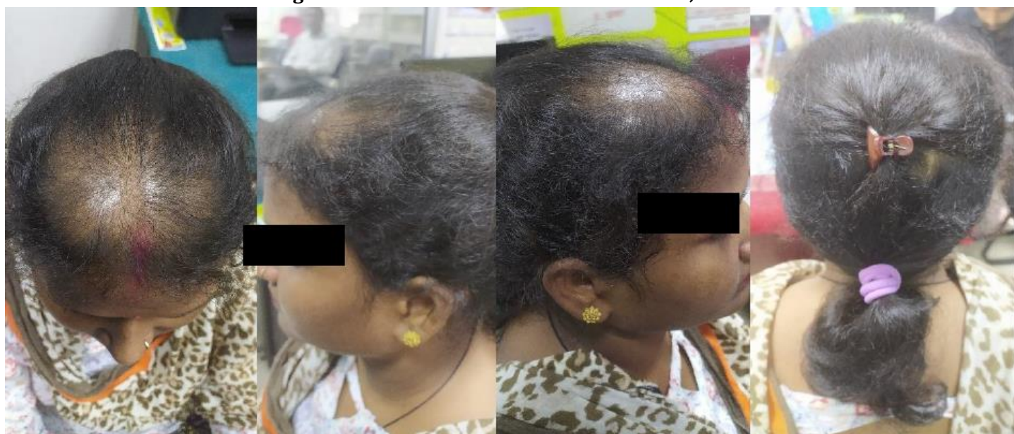
Figure 2: First sitting of Jalaukavacharana on December 13, 2023