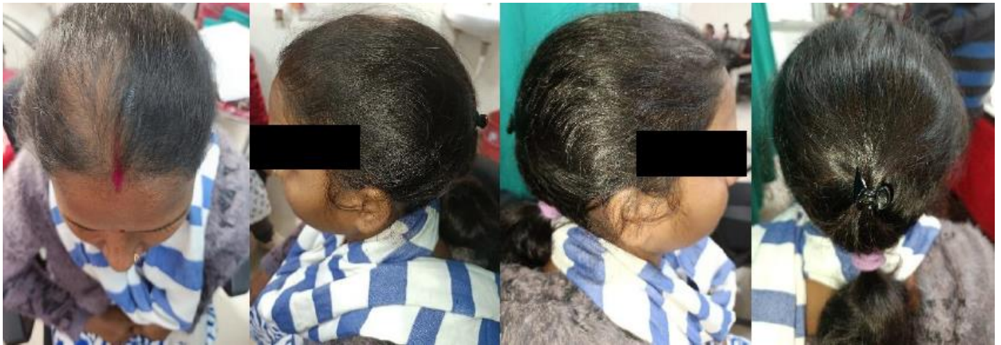
Figure 4: Third sitting of Jalaukavacharana on February 06,2024