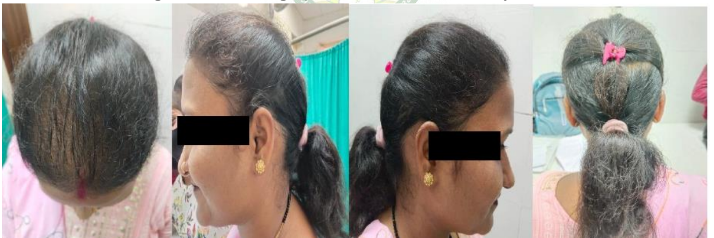
Figure 5: At Follow up