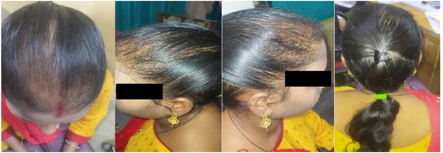
Figure 3: Second sitting of Jalaukavacharana on January 04,2024