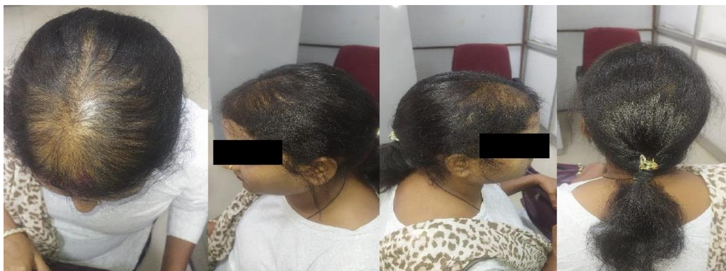
Figure 1: Before treatment on November 24, 2023